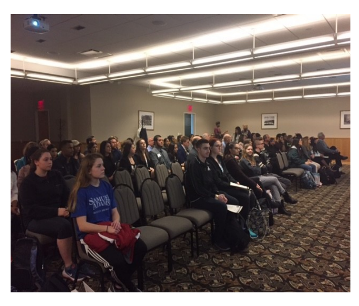
A cross-section of guests at the Honors Week 2017