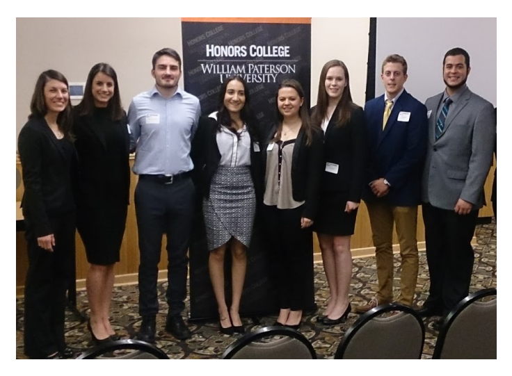
The Graduating Nursing Students pose after their presentations at Honors Week 2017